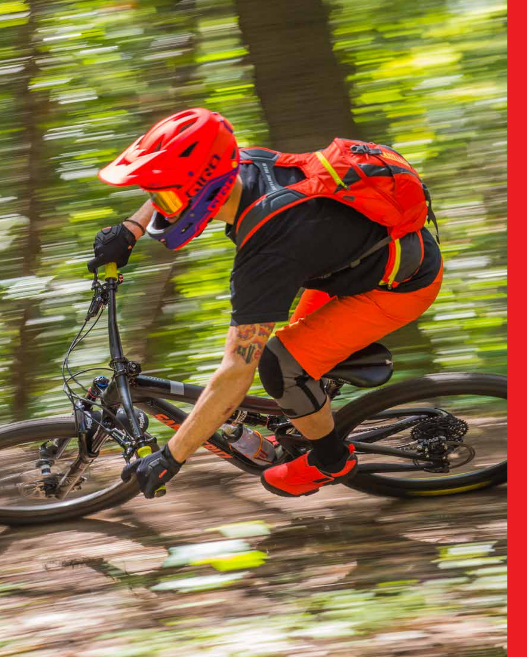
2017 GIRO CYCLING SHOES