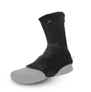
Vermillion / Black