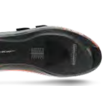
Synthe MIPS Helmet, Chrono Pro Jersey, Chrono Pro Bib Short, Zero CS Glove, HRc Team Sock, Factor Techlace Shoes