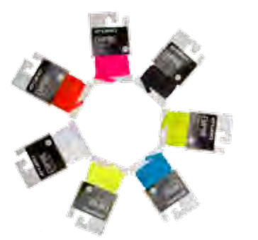
Vermillion / Black

CUSTOMIZE YOUR EMPIRES WITH REPLACEMENT LACES Pg 141